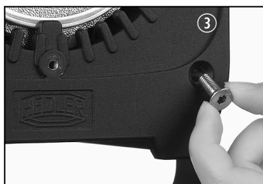
3. Remove the socket screw, located on the right hand side and beneath the light unit's reflector and lamp(s) at the front plate.