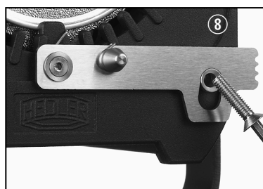
8. Insert the socket screw M6x25 through the brass bushing into the thread and tighten the socket screw hand-screwed.

Please, check the correct function: the QuickFit handle must be automatically moving into it's home position if it's not manually operated.