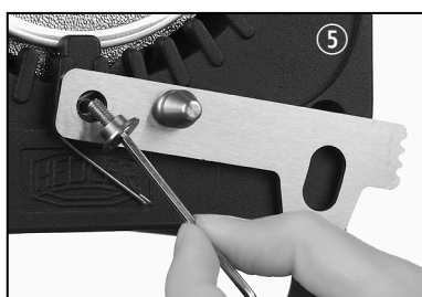
5. Insert the small socket screw M4x12 into the silver-coloured distance disc.

Now, insert the combination socket screw + distance disk into the QuickFit handle (as shown - photograph 5).