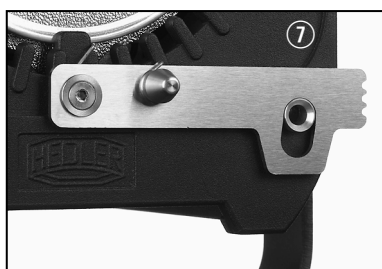
7. Rotate the QuickFit handle anti-clockwise until it's (additionally driving the tension spring) long hole is positioned over the thread of the under point 3 removed screw. In this position, insert the brass bushing into the handle's long hole.