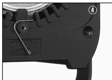
4. Position the tension spring on the light unit's housing front plate as shown. Please note, that the hook-shaped opening of the tension spring encompasses (from the right side) the safety glass holder as shown.