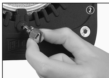
2. Remove the knurled thumb screw, located centred and beneath the light unit's reflector and lamp(s) at the front plate.

Please check by means of the photograph #1 the completeness of your HEDLER QuickFit - Retrofit set