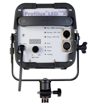
< 5058 > HEDLER Profilux LED x